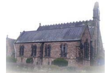
St Peter's Church, Forsbrook

It's great that you are considering baptism for your child or yourself or maybe hoping to become a godparent. As a church we love welcoming new families into our community.