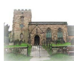
St Margaret's Church, Draycott